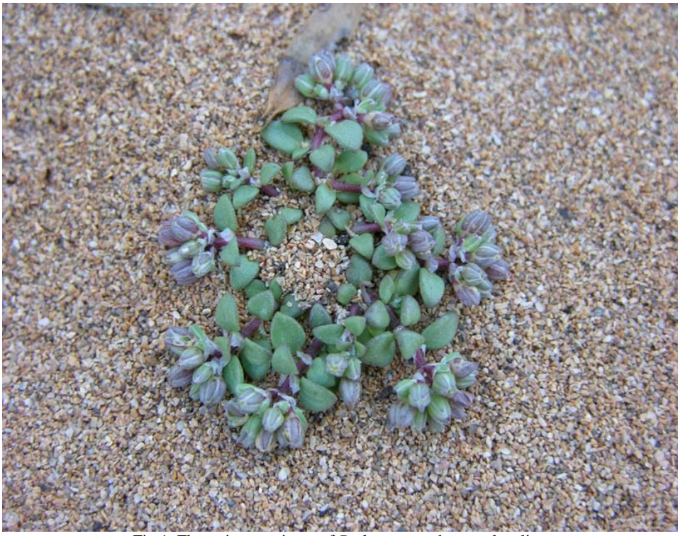
Fig 1. Flowering specimen of P. dunense at the type locality.