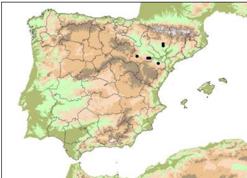
Fig. 4. Distribution of Orobanche loscosii , sp. nov.

by a particularly warm, sunny and dry Mediterranean climate due to the rain shadow cast by the Pyrenees. Average annual rainfall is between 300 and 450 mm, average daily maximum temperature between 20 and 21°C, average minimum between 7 and 9°C and the sun shines between 2600 and 2700 hours per year.