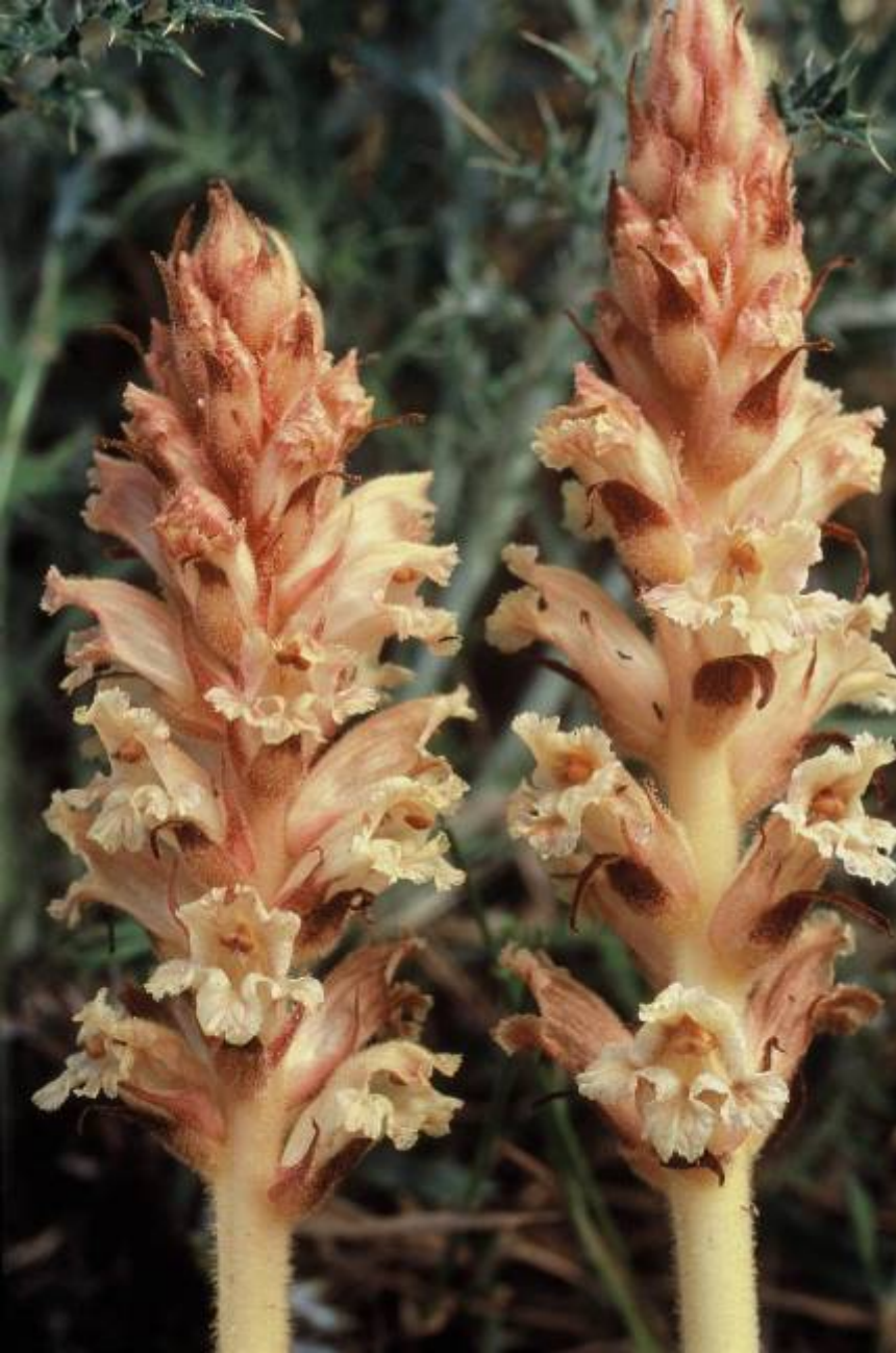
Fig. 3. Orobanche loscosii , sp. nov. , pr. Marivella (Calatayud, Zaragoza, Spain), 30TXL1781, 600 m, beside Echinops ritro , G. Moreno Moral MM0074/2008, 5-VII-2008 (herb. Sánchez Pedraja 13190).